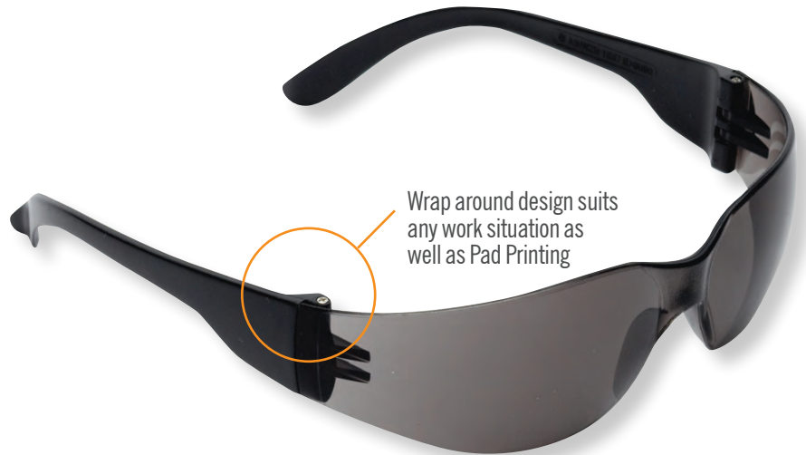
1602 - Smoke Lens

Wrap around design suits any work situation as well as Pad Printing